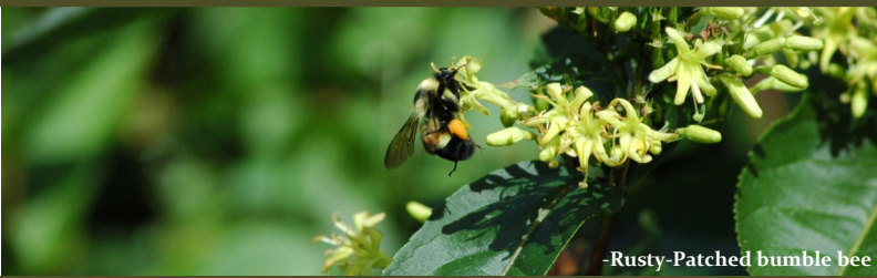
-Rusty-Patched bumble bee

Pollinators and flowering plants depend on each other. Wisconsin pollinators include bees, butterflies, beetles, flies, moths, and hummingbirds. Bees and other pollinators transport pollen from flower to flower as they forage, allowing for plant fertilization and fruit and seed production. Approximately 75% of the world's major food crops require or benefit from pollination by animals. Flowering plants provide nectar and pollen for a bee's diet. Pollen is an essential protein source for developing bee larvae, and nectar provides carbohydrates.